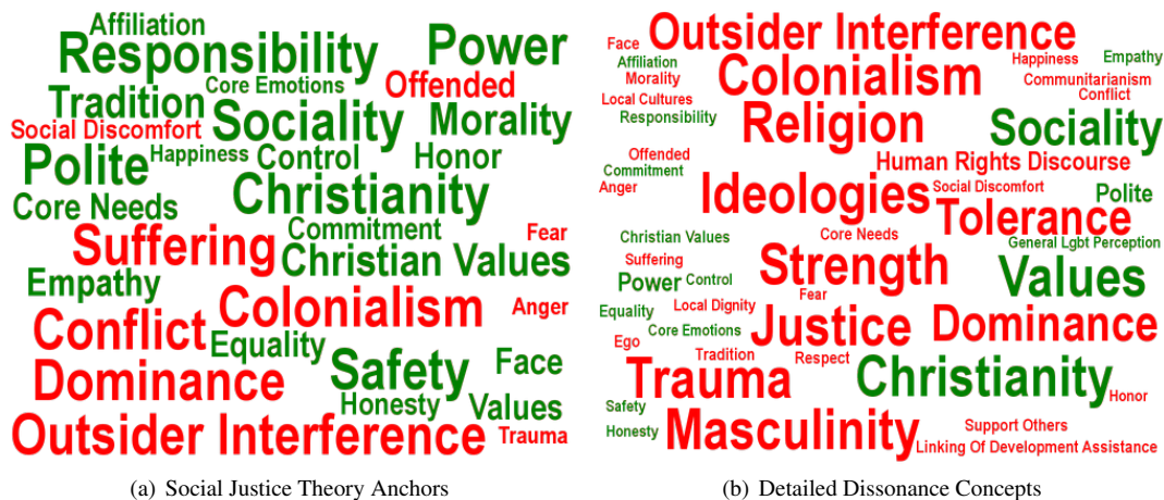
Fig. 3. How should we create persuasive appeals for the Africa LGBT scenario?