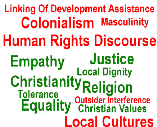
Fig. 6. Concepts In Conflict ( Conflict Essence )

At each round, the agent chooses options that have been determined to best meet the needs of the other side while avoiding overly negative costs for one's own side. Potential offers that would be insulting to or overly damaging to either side are automatically suppressed.